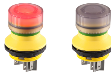
Fig. 3: active inactive