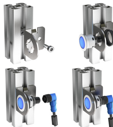
Fig. 4: connection M12 connect

Name/address of issuer: Georg Schlegel GmbH & Co. KG, Kapellenweg 4, 88525 Dürmentingen Responsible for documentation: Georg Schlegel GmbH & Co. KG, Kapellenweg 4, 88525 Dürmentingen Product descriptions Emergency-stop devices Type references: refer to above table 2.2